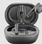
Poly Voyager Free 60+ Earbuds